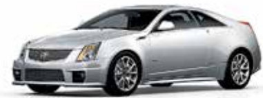
RADIANT SILVER METALLIC

A meticulous 3-layer process that results in a dramatic hue-shifting color.